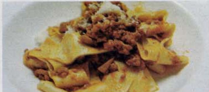
Tuscan ragu does not call for pasta to be swimming in sauce. The meat sauce can be served over pasta or ravioli, or used in lasagna.

He designed three dishes that may surprise some who think Ital-